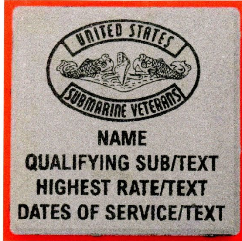
Custom Engraved 8” x 8” Paver

“Dedicated to the men and women who design, build, operate, and maintain submarines, and the families and communities who support them”